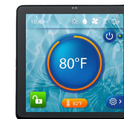
Alarm display, diagnosis and solution

Manage settings and easily access all system information