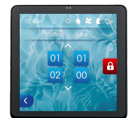
Lockable screen to prevent undesired changes