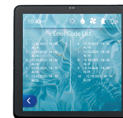
History access (last 50 events)